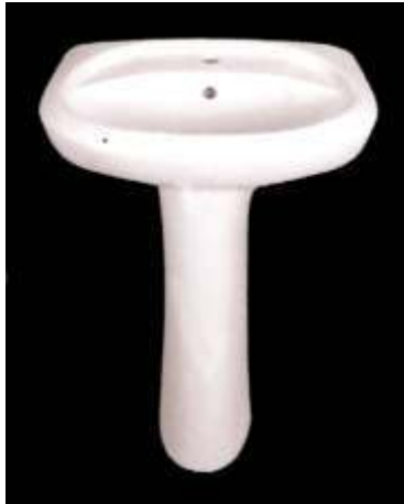
Name: REPOSE Cat No.: 1008 Size: 55X40 cms