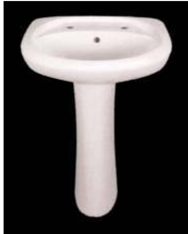
Name: REPOSE Cat No.: 1008 A Size: 55X40 cms