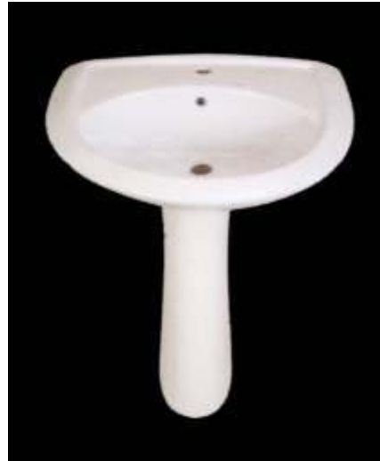
Name: GRECIA Cat No.: 1015 Size: 63X45 cms