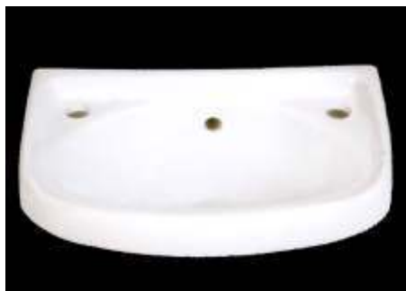
Name: BENTUM Cat No.: 1003 A Size: 45X30 cms