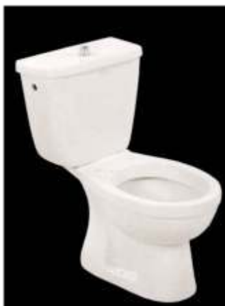
Name: GOLD SLEEK E.W.C. "S" TRAP Cat No.: 5001