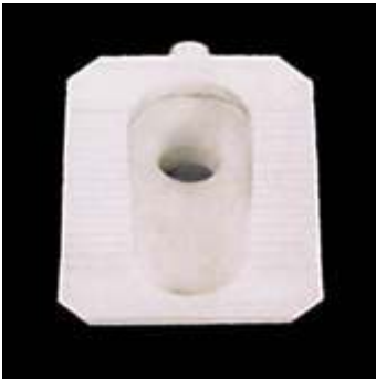
Name: MEDIUM DEEP Cat No.: 2021 Size: 20"