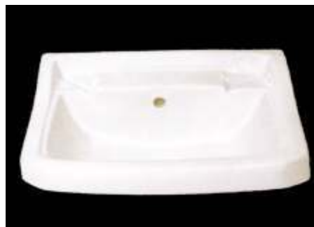
Name: TAIWAN Cat No.: 1005 A Size: 44X40 cms