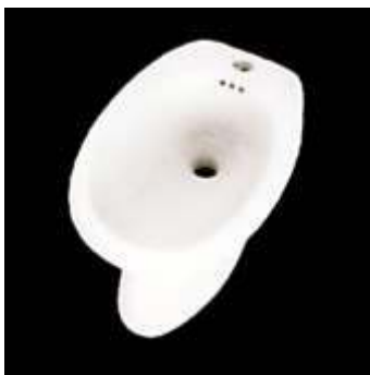
Name: BIDET Cat No.: 2020