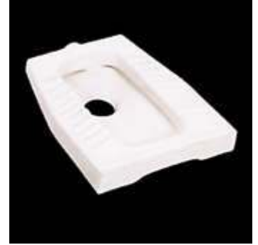
Name: FLAT SQUATING PAN (Estern Pan) Cat No.: 2004 Size: 21"