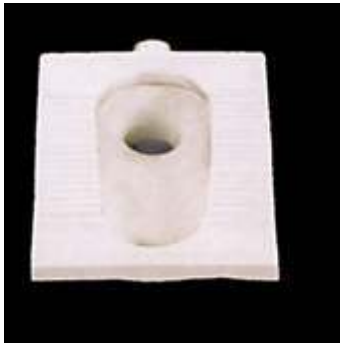
Name: FULL DEEP (Orrissa Pan) Cat No.: 2023 Size: 20"