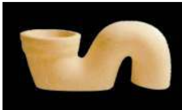
Name: "S" TRAPE Cat No.: 3009