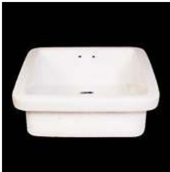
Name: CERAMIC SINK Cat No.: 6002 Size: 20"X16"X6"