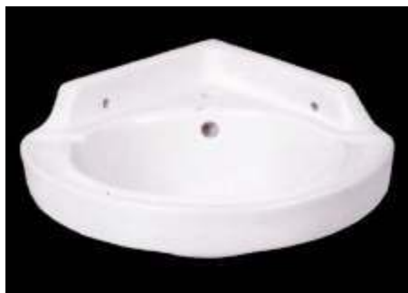
Name: CORNER Cat No.: 1002 Size: 40X40 cms