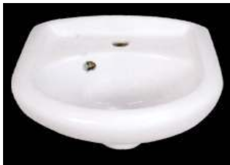
Name: CREATIVE Cat No.: 1004 Size: 36X28 cms