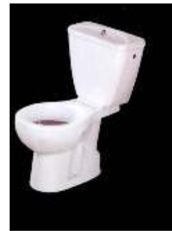
Name: NANO E.W.C. "S" TRAP Cat No.: 3090