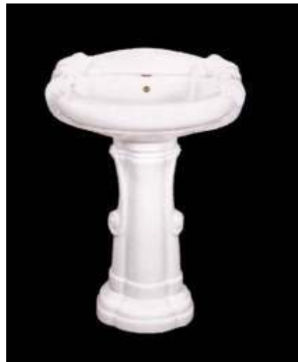
Name: TRUSTED Cat No.: 3001 Size: 63X45 cms