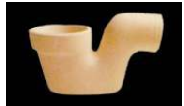
Name: "P" TRAPE Cat No.: 3008