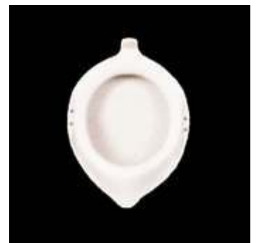
Name: WALL URINAL FLAT BACK Cat No.: 2607