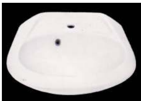
Name: SHELLY Cat No.: 1027 Size: 45X33 cms