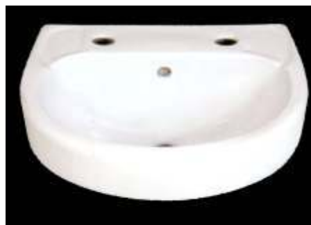
Name: TINNY Cat No.: 1005 A Size: 44X40 cms