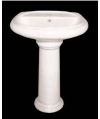
Name: BRISTOL Cat No.: 3004 Size: 55X40 cms