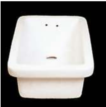
Name: CERAMIC SINK Cat No.: 6001 Size: 18"X12"X6"