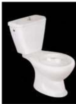
Name: REGAL (ITALICA) E.W.C. "S" TRAP Cat No.: 3060