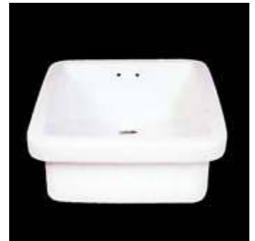
Name: CERAMIC SINK Cat No.: 6003 Size: 24"X18"X8"