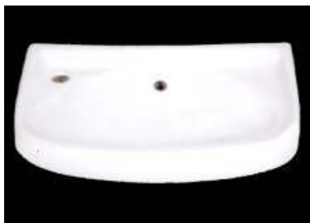
Name: BENTUM Cat No.: 1003 Size: 45X30 cms