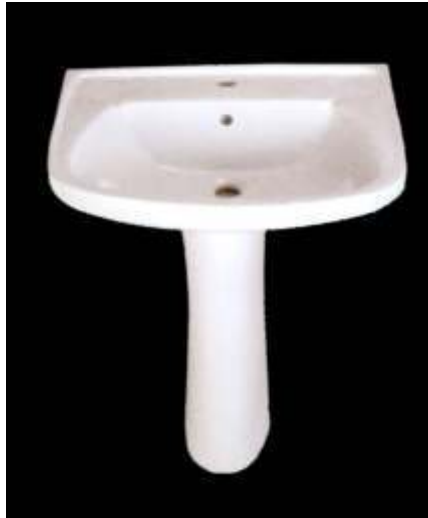
Name: LABANESE Cat No.: 1036 Size: 60X48 cms