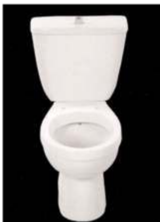
Name: GOLD SLEEK E.W.C. "P" TRAP Cat No.: 5002