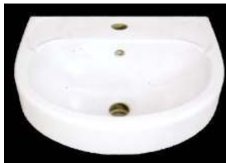
Name: TINNY Cat No.: 1005 Size: 44X40 cms