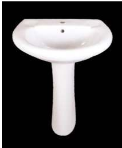
Name: CAPRICE Cat No.: 1010 Size: 63X51 cms