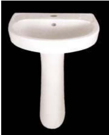
Name: TINNY Cat No.: 9001 Size: 50X40 cms