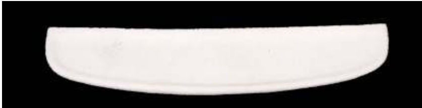
Name: SELF Cat No.: 3005