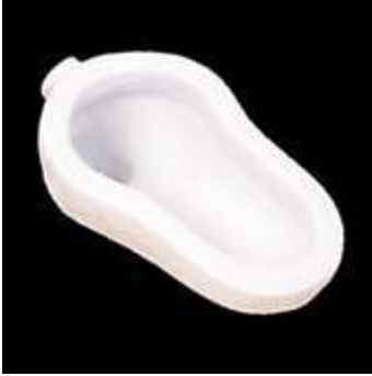
Name: I.W.C. (Deep Squating Pan) Cat No.: 2001 Size: 18" or 20" or 23"