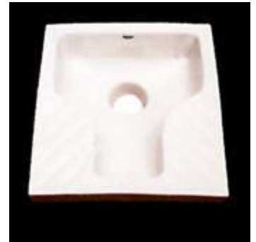
Name: TURKISH SQUATING PAN Cat No.: 2064