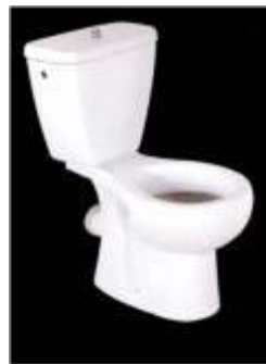
Name: NANO E.W.C. "P" TRAP Cat No.: 3091