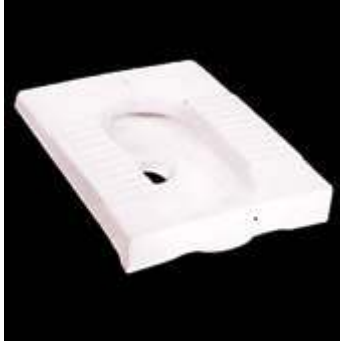
Name: KHAZZAF SQUATING PAN Cat No.: 2017 Size: 20"