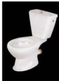
Name: REGAL (ITALICA) E.W.C. "P" TRAP Cat No.: 3060 A