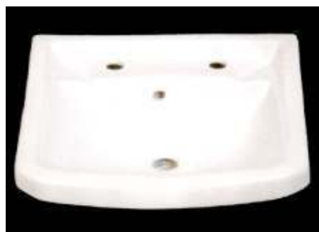
Name: TAIWAN Cat No.: 1006 A Size: 50X40 cms