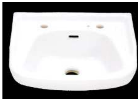
Name: STAINLY Cat No.: 3027 Size: 40X38 cms