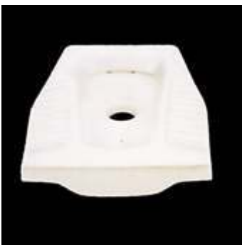
Name: LEBANESE SQUATING PAN Cat No.: 2053 Size: 23"